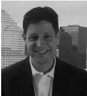
JC Shore Bio:

As the solar industry continues to mature, most of the focus revolves around technological innovation and manufacturing efficiencies. However, design is quickly becoming a vital component in the integration of solar on commercial and residential structures. Regardless of whether you're dealing with a solar retrofit or proactively integrating solar PV during construction, a proper design can have significant effects on production, appearance, and most importantly, cost. This course will provide architects with a foundation of knowledge specific to the design of a solar PV system so that they are able to respond to their clients effectively and immediately.