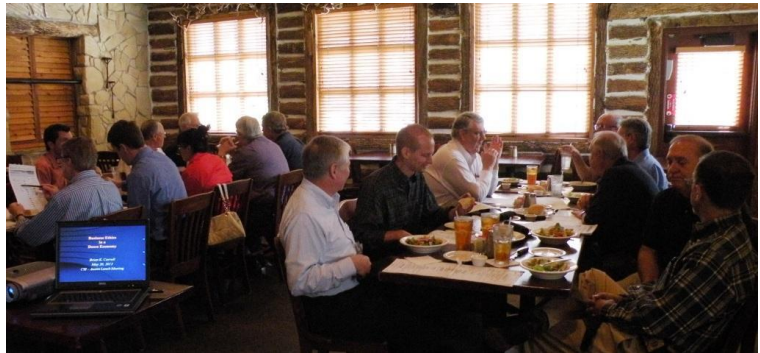
Another great turn out. Great to see new faces. Thanks for supporting CSI!