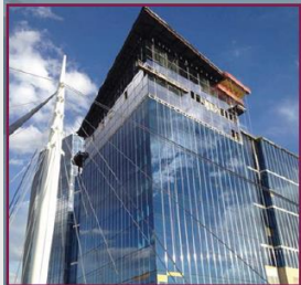
DaVita World Headquarters

The building enclosure represents the first, last and only line of defense separating the conditioned interior building space from the exterior elements. It controls heat flow, moisture flow and air flow. In addition to being a primary component for energy efficiency in a building and controlling occupant comfort, it must also provide protection from rain, snow, hail, wind, water vapor migration, dust, pollutants, and allergens. During this informative lunch & learn presentation, Pie will discuss the emerging trend of building enclosure commissioning (BECx), as well as air barriers and whole building air tightness testing requirements such as those required by the U.S Army Corps of Engineers, GSA, and other organizations.