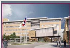
Ft. Hood Army Hospital