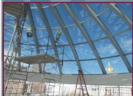
Colorado Judicial Center